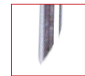
Bevel Tip Stylet