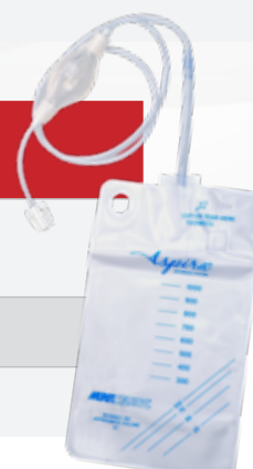
Aspira Drainage System with bag