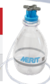
Aspira Drainage System with bottle