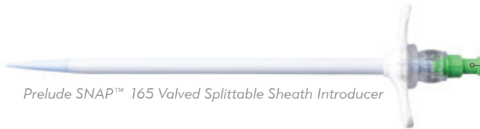
Prelude SNAP™ 165 Valved Splittable Sheath Introducer

For placement flexibility, Aspira's malleable, pre-bent tunneler is 37% longer than the PleurX. TM1