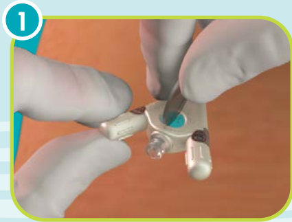
1 Rotate stopcock to unlocked position