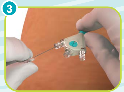
3 Unscrew cap, pull release wire, and remove external drainage catheter