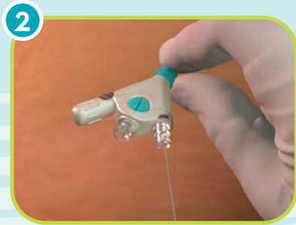
2 Unscrew cap and remove loop suture