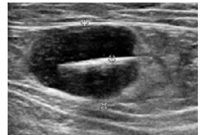
SCOUT REFLECTOR IN INGUINAL LYMPH NODE