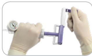
Fold-out handle hand placement.