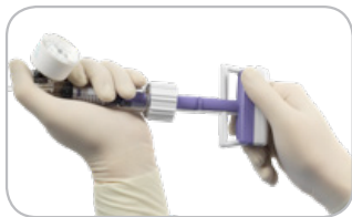
Standard hand placement.

The basixTAU provides the quality and reliability known to Merit inflation devices and includes a revolutionary design of an added fold-out handle reducing the rotational force by 67%* during inflations.