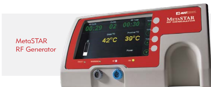
MetaSTAR RF Generator