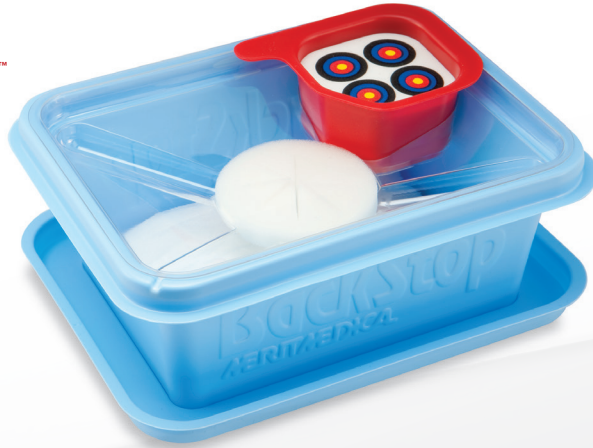
BackStop+™ & MiniStop+™ Disposal System with Temporary Sharps Holder