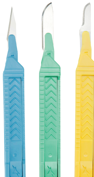
Futura® Safety Scalpels