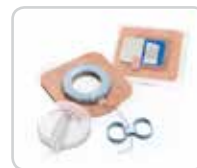
Revolution™ and StayFIX® Fixation Devices