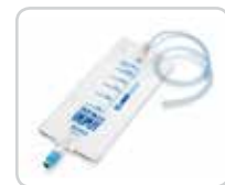
Merit Drainage Depot™ Drainage Bags

Contact your Merit Sales Professional to place an order.