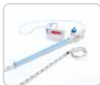
ReSolve® Locking Drainage Catheter