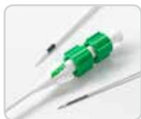
MAK-NV™ Introducer System