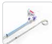
ReSolve® Biliary Locking Drainage Catheter