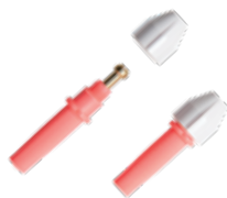
MAP500 Torque Device