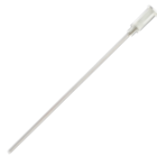
MAP550 Metal Insertion Tool