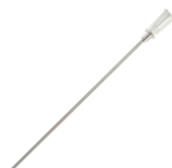
MAP550 Metal Insertion Tool