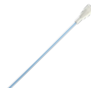
MAP600 Plastic Insertion Tool