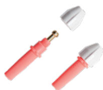
MAP500 Torque Device