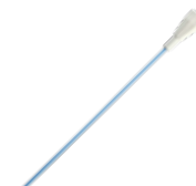
MAP600 Plastic Insertion Tool