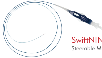
SwiftNINJA® Steerable Microcatheter