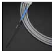
MAXXWIRE® Guide Wire