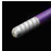
Brighton® Bipolar Coagulation Probe