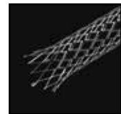
ALIMAXX-B® Biliary Stent