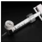
BIG60® Inflation Device