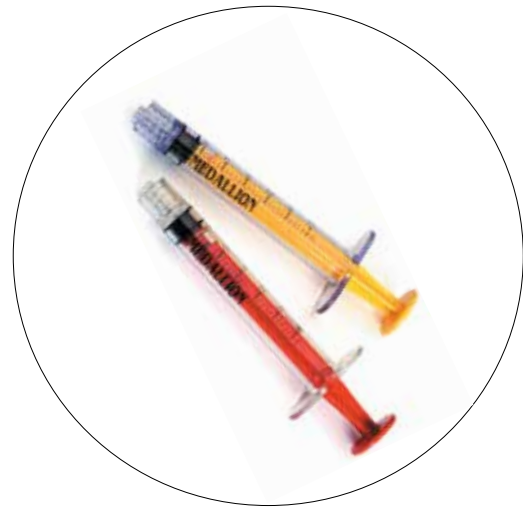
Two Medallion Syringes packaged with each Maestro Microcatheter

Now Available with Tenor ® Micro Guide Wire