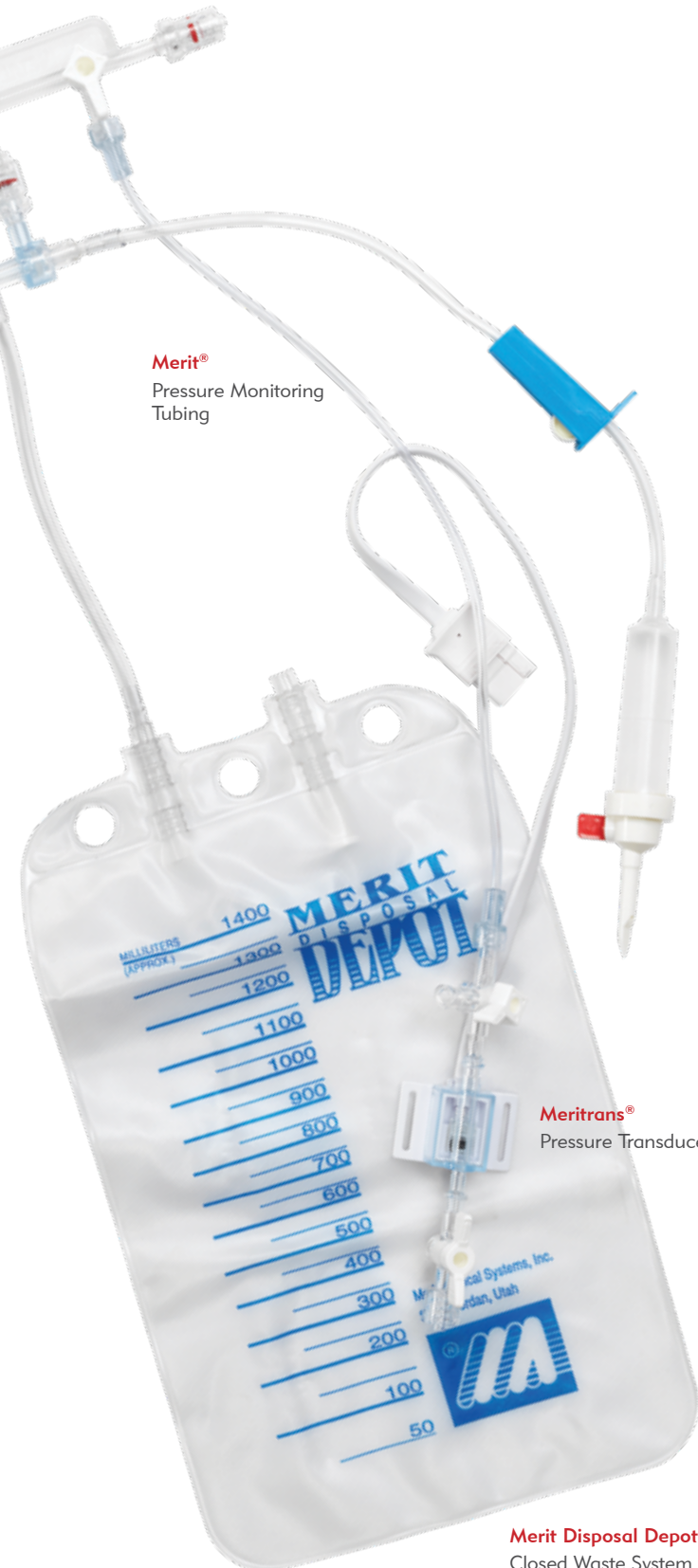
Merit® Pressure Monitoring Tubing