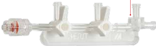
Integrated Check Relief Valve

Devos™ manifolds feature an integrated check relief valve on the port furthest from the rotator to provide directed flow control.