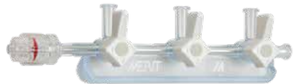
Wide Port Spacing