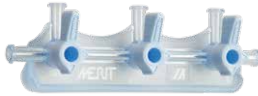
All Female Ports