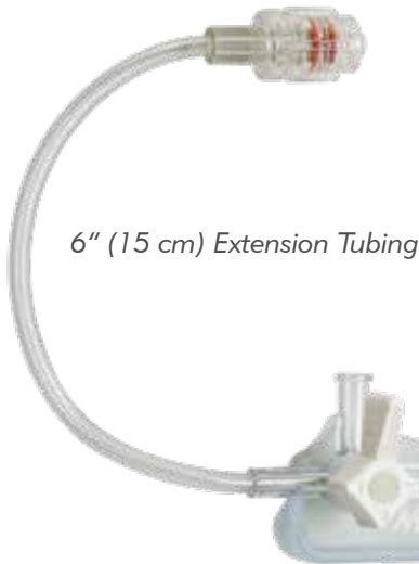
6" (15 cm) Extension Tubing