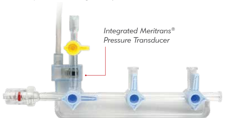
Integrated Meritran® Pressure Transducer

The TRAM® manifold with an integral transducer and 48" (122 cm) cable gives a single operator the convenience to debubble, zero, and rezero within the sterile field. Low-torque, easy-to-turn wide-spaced handles provide greater comfort, even when utilizing higher injection pressures. TRAM-P™ compensating manifolds allow pressure readings at any level.