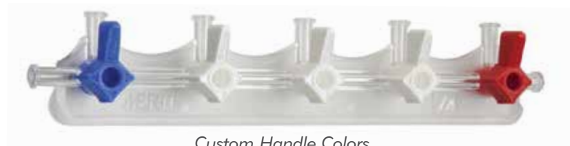
Custom Handle Colors